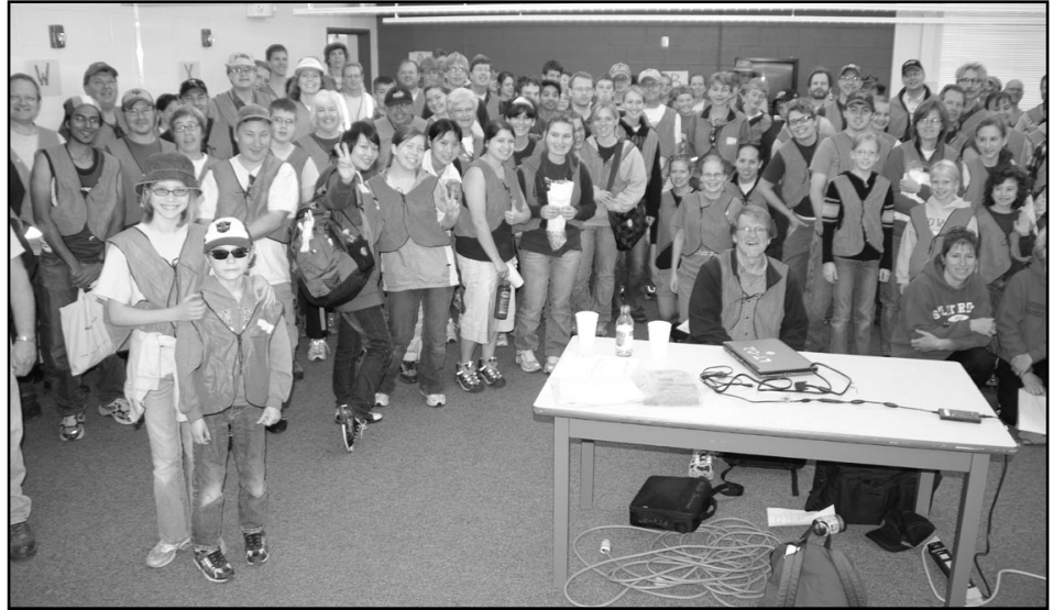
More than 130 local volunteers planted trees along Highway 28 on Sept. 20.

These private efforts supplement Morris's municipal tree programs. The City usually plants between 80 and 115 new shade trees each year. This fall, 105 boulevard trees were planted along city streets. Morris spent $15,600 in 2008 on the shade tree program, says Jim